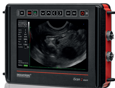
iScan 2 MULTI