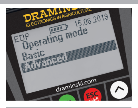
Basic / Advanced - operating mode available in the menu